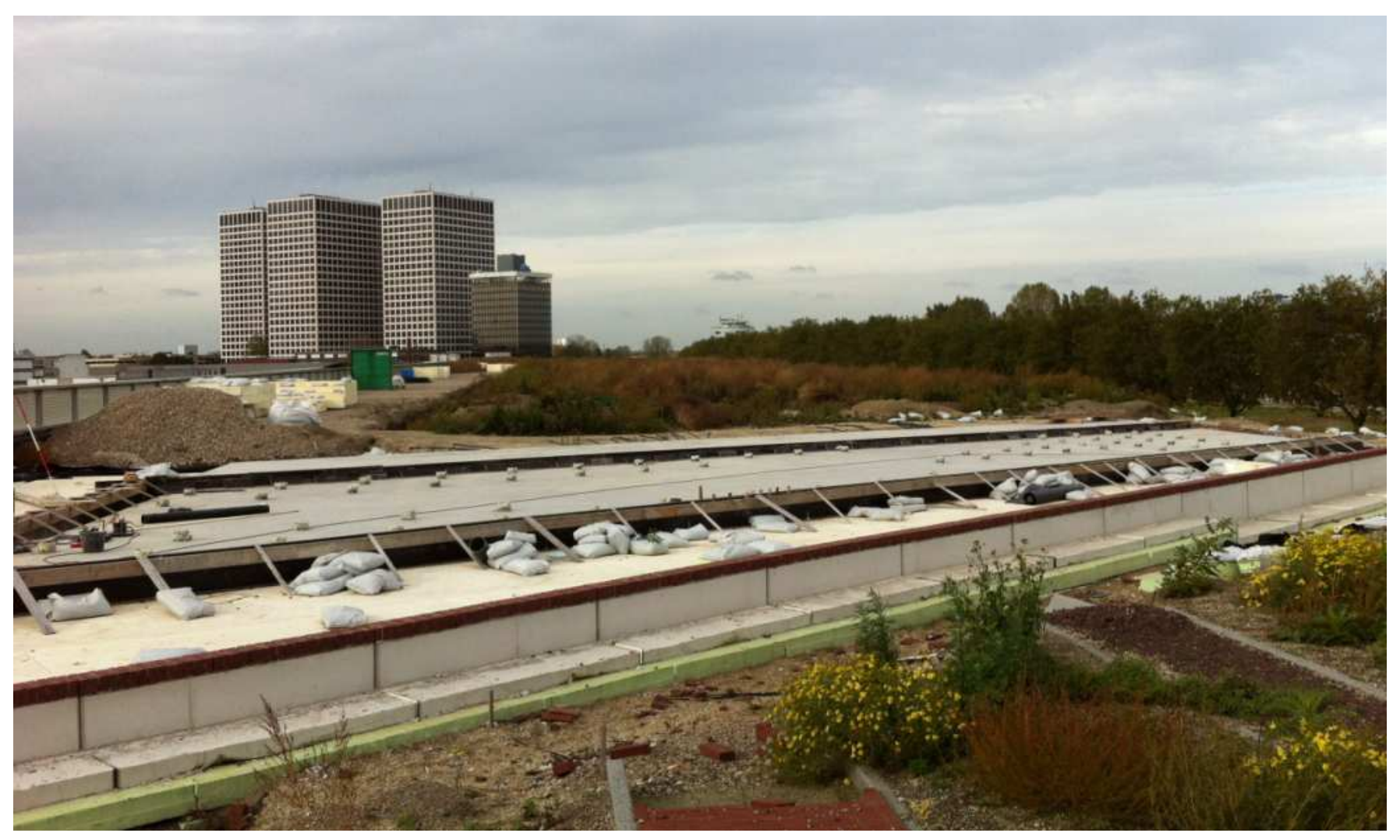
A cascade will be visible here

Above a commercial mall, whose size is 1000 m x 100 m a park is currently under construction