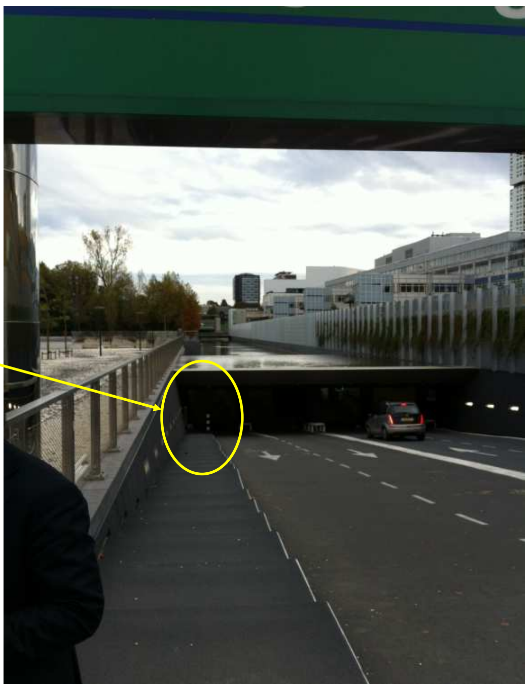
Entrance of the parking