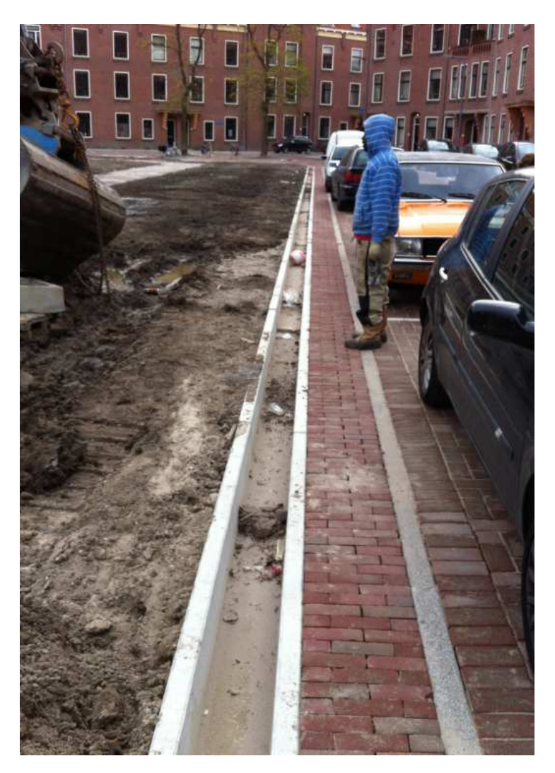
Water flow will be visible