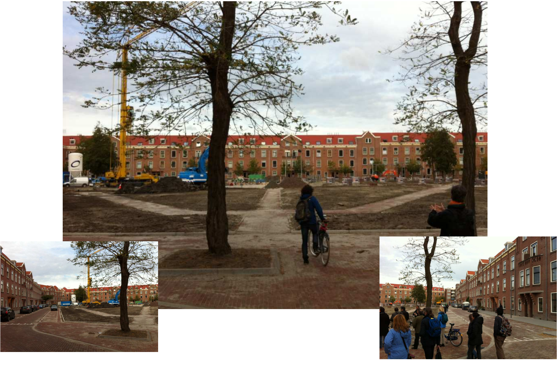
Storm water collected from the area is routed to the square