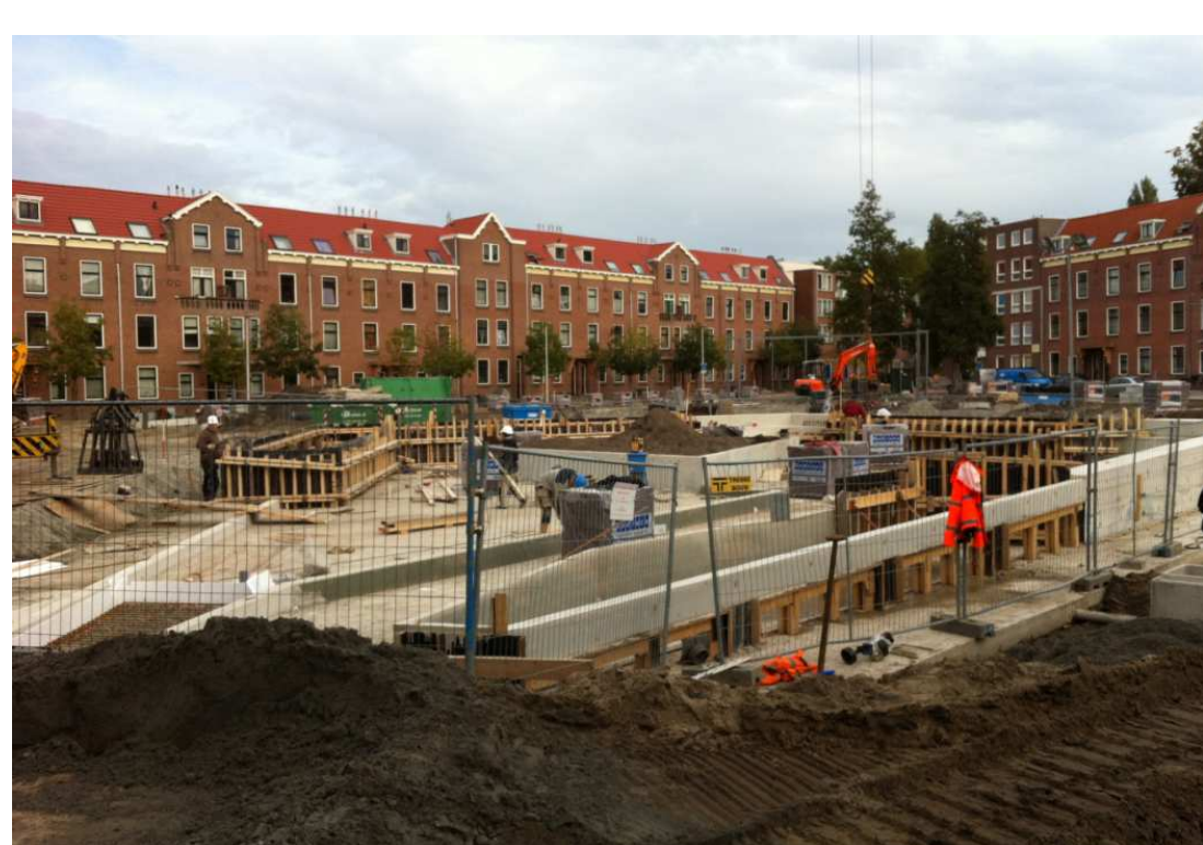
Open air storage basins