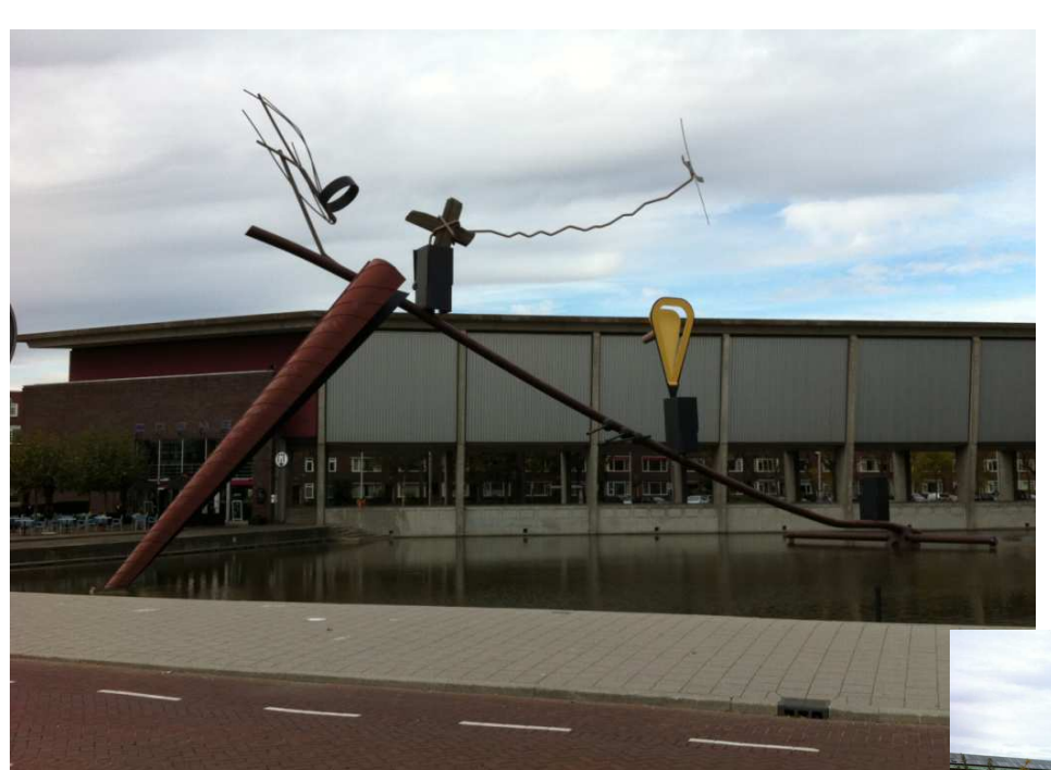
The main sewer of the area is below this pond